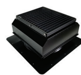
Model Shown AB-3523A in Black Self-Flashing (Attached Panel)

As the sun relentlessly beats down on your home throughout the day, heat can quickly build up in your attic from trapped hot attic air and inadequate ventilation. This excessive attic heat directly impacts both your electric bills and the performance of the HVAC equipment that cools your home. Attic Breeze solar attic fans offer the ideal solution to this problem by using the same energy from the sun to continuously ventilate trapped hot air and cool your attic. The result is a more comfortable home that requires less energy to cool.