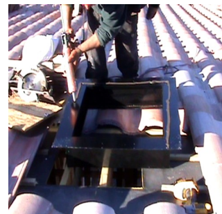
Figure 2 - Apply Sealant