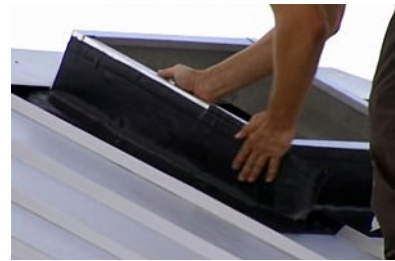
Figure 4 - Side Flashing

Next, flash the sides of the roof curb using a 110 cm roll of Wakaflex® flashing for each side of the curb. Center the flashing on the side of the roof curb, allowing overlap with the previously installed bottom flashing piece and top of curb. Cut the side flashing with scissors to allow for wrapping of the flashing around the roof curb as in the previous step. Remove the adhesive backing from the Wakaflex® flashing and mold the flashing in place around the sides of the curb, as well as over the bottom flashing and roof tiles or metal sheeting (see Figure 4). Repeat for opposite side of roof curb.