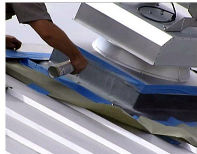
Figure 5 - Painting the Flashing

Your Attic Breeze curb mount solar attic fan is designed to mount directly over the installed roof curb and flashing system. Please refer to the installation instructions included with your Attic Breeze fan to complete the installation of your product.