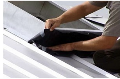
Figure 3 - Bottom Flashing

Begin by flashing the bottom side of the roof curb using a 100 cm roll of Wakaflex® flashing. Center the flashing across the bottom of the curb. Using scissors, cut the flashing to both corners of the roof curb, allowing it to easily wrap around either side of the curb. Remove the adhesive backing from the Wakaflex® flashing and mold the flashing in place around the roof curb, as well as over the roof tiles or metal sheeting below the curb (see Figure 3).